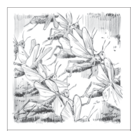
Security Despite Weakness